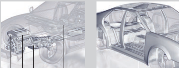
Steering column Magnesium gearbox housing Engine Magnesium cylinder head cover Mass connection (Nuts & washers)

Koninklijke Nedschroef Holding Kanaaldijk N.W. 75 P.O. Box 548 5700 AM Helmond The Netherlands T +31 492 588 556 F +31 492 548 084 E holding@nedschroef.com